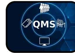
Queue Management System